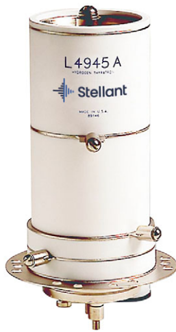
L4945 A Thyatron

Stellant Systems' L4945 A is a ceramic-metal, double-gap tetrode deuterium thyatron. It is designed for applications with high coulomb transfer and/or high anode current reversal, such as encountered in crowbar applications. The shielded-gap, gradient-grid construction ensures stable, long-term, HV hold-off reliability while minimizing X-ray emission. An auxiliary grid is incorporated for constant short triggering delay time and drift. The tube can be mounted in any position by means of the mounting flange. Cooling can be achieved by forced air or dielectric fluid immersion.