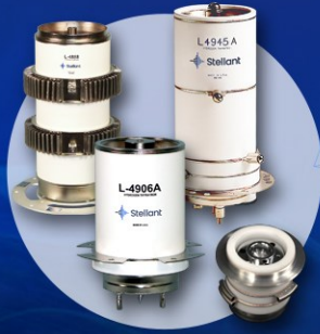
Thyratrons & Electronic Emitters (E-Guns)