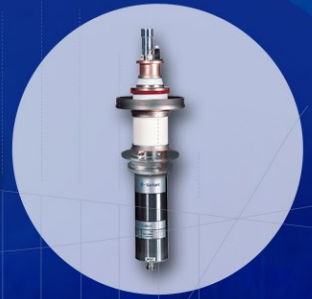
Inductive Output Tubes (IOTs)