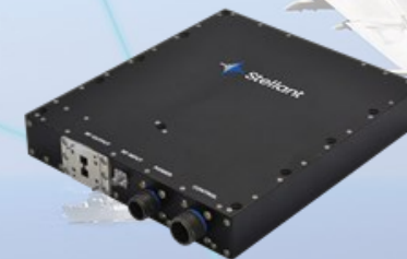
6.5 – 18 GHz, 200W