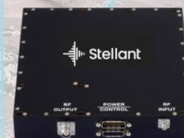
High Band 6.0 – 18 GHz, 125 W