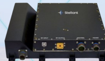
Millimeter-Wave 18 – 40 GHz, 100 W