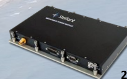
Low Band 2 – 6 GHz, 80 W