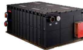
25cm XIPS® PPU

The PPU also provides timing and sequencing for thruster on and off commands, performs fault-protection to avoid damage to the thruster and any of the spacecraft components, and provides telemetry for measuring thruster performance and subsystem state of health.