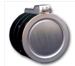
25cm XIPS® Thruster