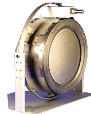
30cm XIPS® Thruster