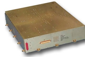
30cm XIPS® PPU